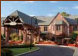
The Belvedere of Westlake