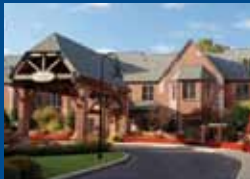
The Belvedere of Westlake