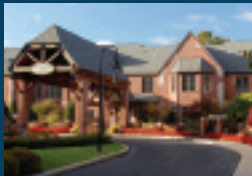
The Belvedere of Westlake