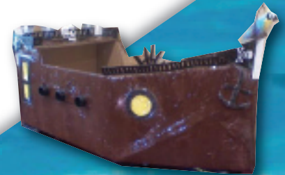
“Breaking Wind” was the winner of the “Wacky Races”